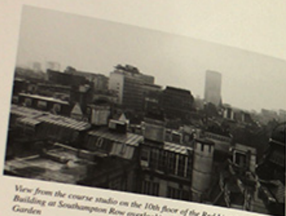
View from the course studio on the 10th floor of the Red Lion Square Building at Southampton Row overlooking Holborn towards Covent Garden

MA Creative Practice for Narrative Environments was launched in 2003 and this catalogue features the first students to graduate. The 14 projects on show propose novel ways to tell stories as urban and architectural interventions, sound and light installations, retail experiences, exhibition experiences and alternative event designs. The last two years have been an exhilarating journey for students and staff alike and led to numerous successful collaborations. The course has established itself as an open forum for debate among students, academics and practitioners. Enormous thanks are due to the course affiliates, leading figures from commercial and cultural industries, who have given lectures, attended crits, mentored students, provided placements and sponsored live projects.